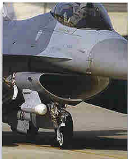
F-16 Landing Gear ▲

For over 30 years LOUD Engineering has performed a broad range of Design, Prototyping, Manufacturing and Testing/Qualification services for Landing Gear Systems, Actuators, Steering Damping Actuators, Valves, Manifolds, and Ground Support Equipment for the Aerospace Industry.