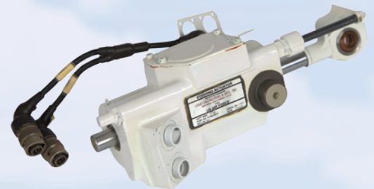
Nose Wheel Steering Actuation, Aircraft