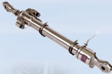
Landing Gear Door Actuation